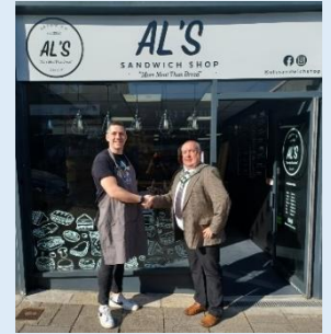
Siop Brechdanau Al's Al's Sandwich Shop