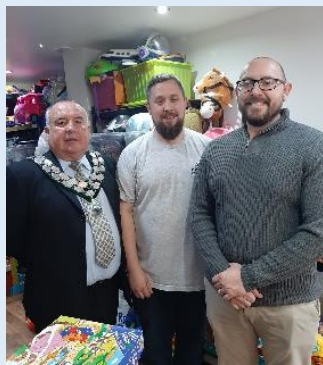
Toy Box, Clive Street