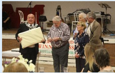
Efeiliad Tref Town Twinning