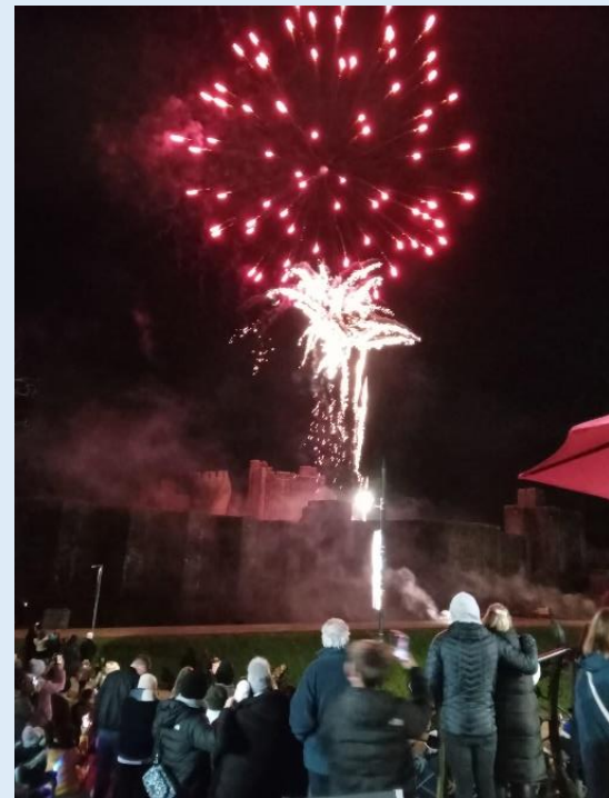
Fireworks to finish a great night