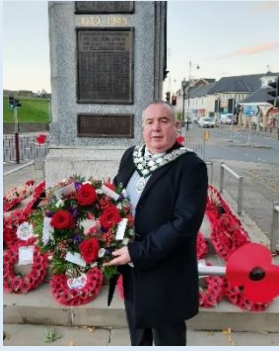
Dydd Y Cofio Remembrance Day