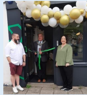
Siop Cannwyll Bwthyn Bwthyn Candle Shop