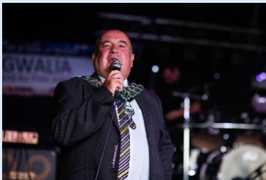
Diwrnod Anferth MegaDay 2022