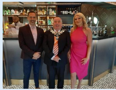
Bwyty Gatehouse restaurant