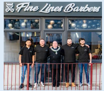
Fine Lines Barbers, Piccadilly