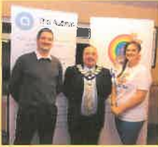
Charity Launch 2018 Lansiad Elusen 2018