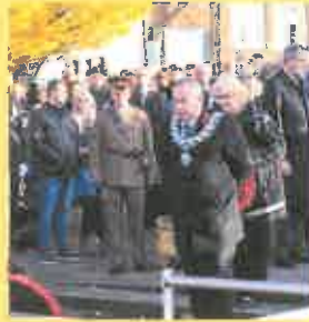
Remembrance Day 2018 Dydd Y Cofio 2018