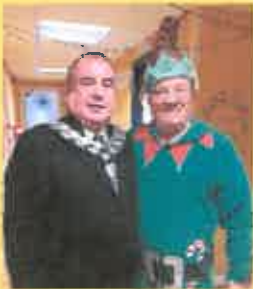
Visit to Bro Davel with the Lions Ymweliad â Bro Davel qyda'r Llewod