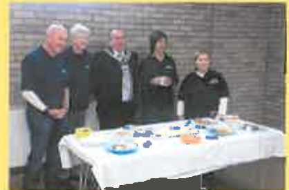
Caerphilly Street Pastors Bugeilard y Stryd, Caerffili