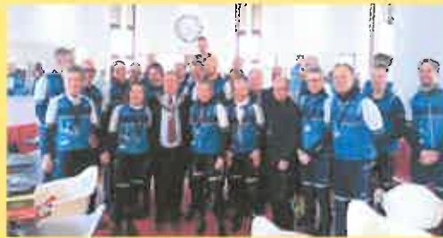
Visit of Dutch Cyclists commemorating 75 th anniversary of the liberation of their village by Welsh soldiers Ymweliad gan Feicwyr Iseldiraidd i gofio cylchwyf 75 rhyddhad eu pentref gan fitwyr o Gymru