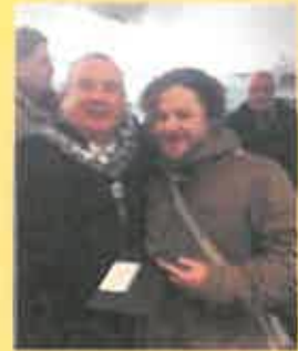
Art Competition 2019 Winner Ennillydd Cystadleuaeth Gelf 2019